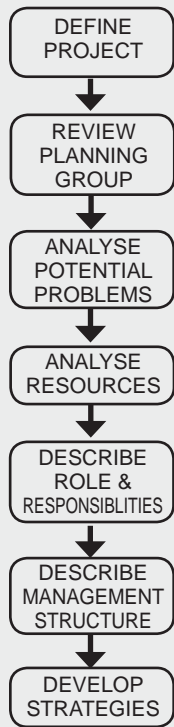
Figure 1: Emergency planning process

For the health sector plan, the process will: